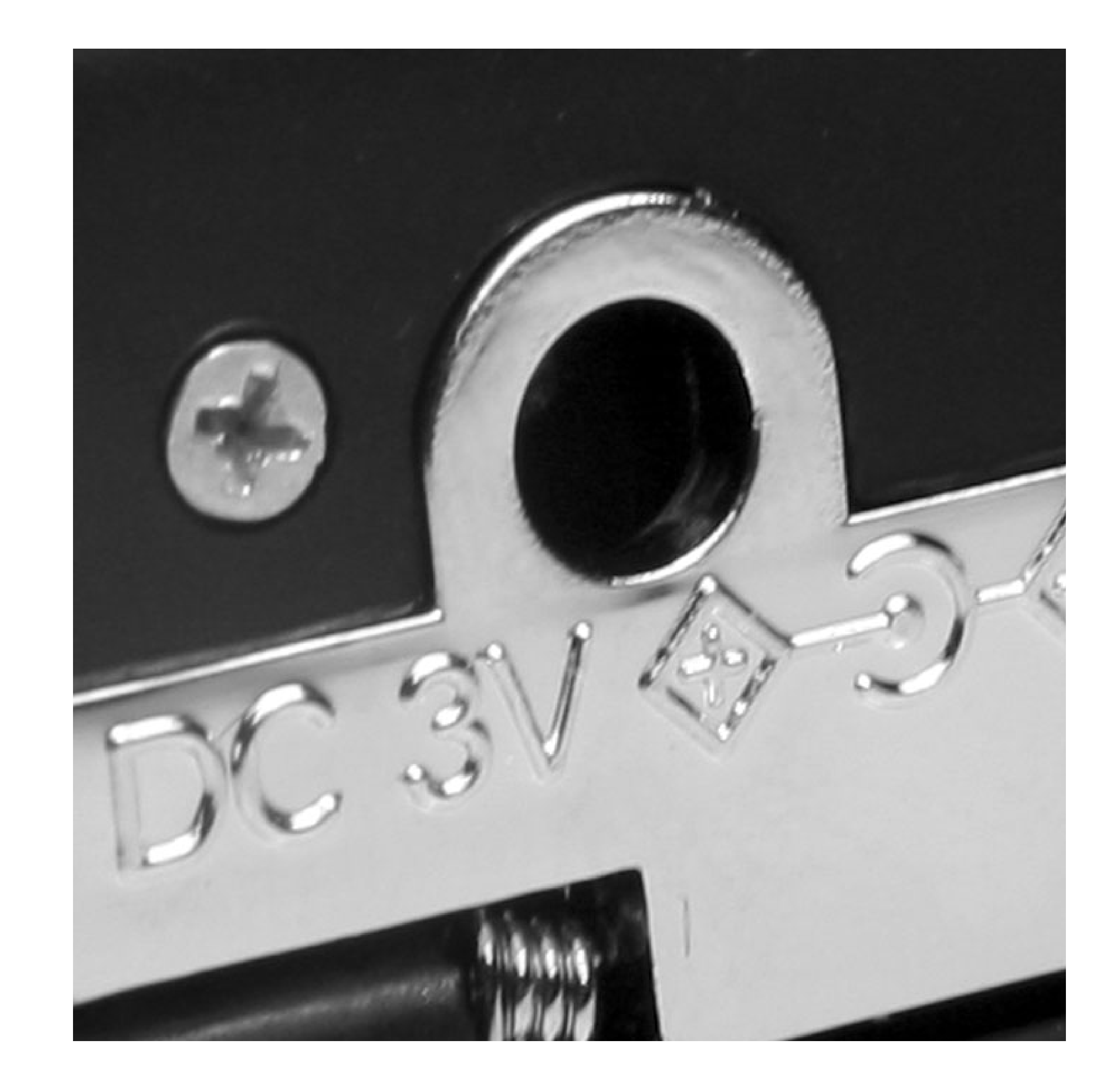
Rediscover your old audio-cassette tapes on the go. Convert your old mix tapes and cassettes to MP3 to Playback on iP-ods/MP3 players or burn to CD.