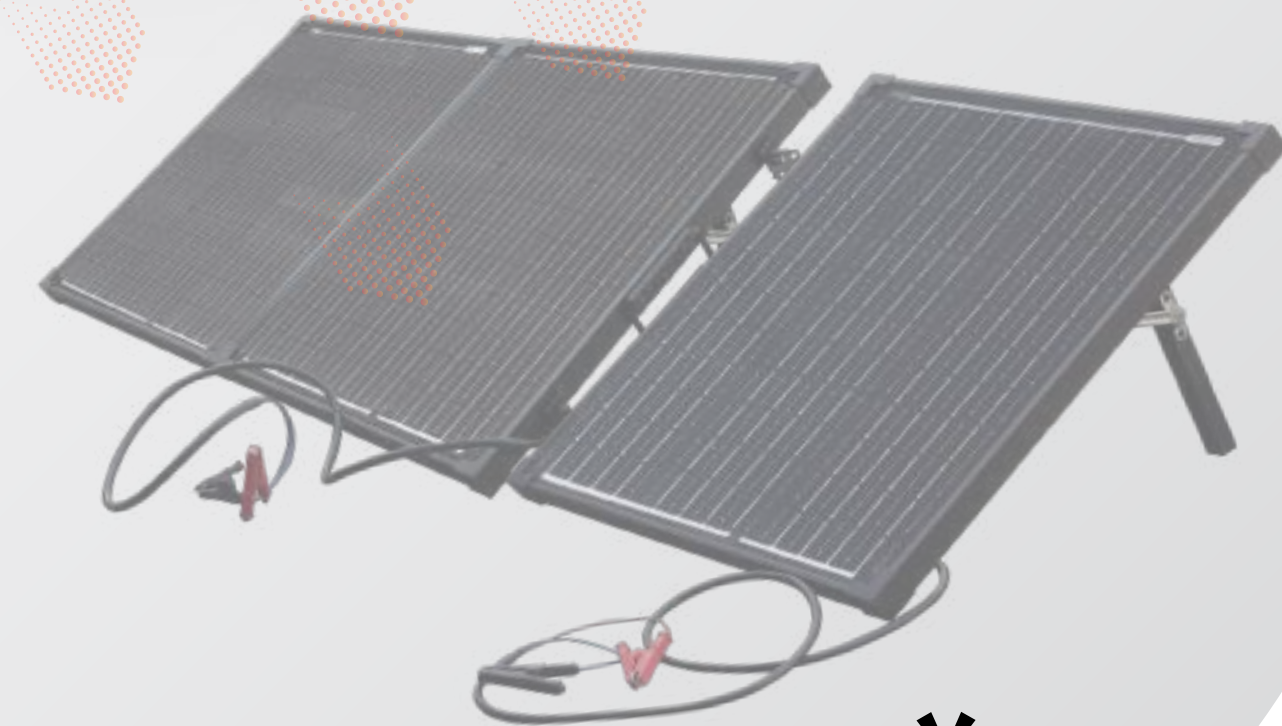
Solar panel * TX-215 / TX-214