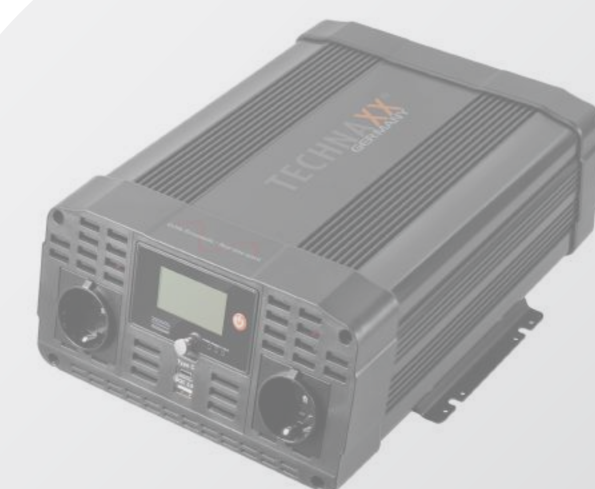
Power Inverters * TE16 TE19 TE20 TE22