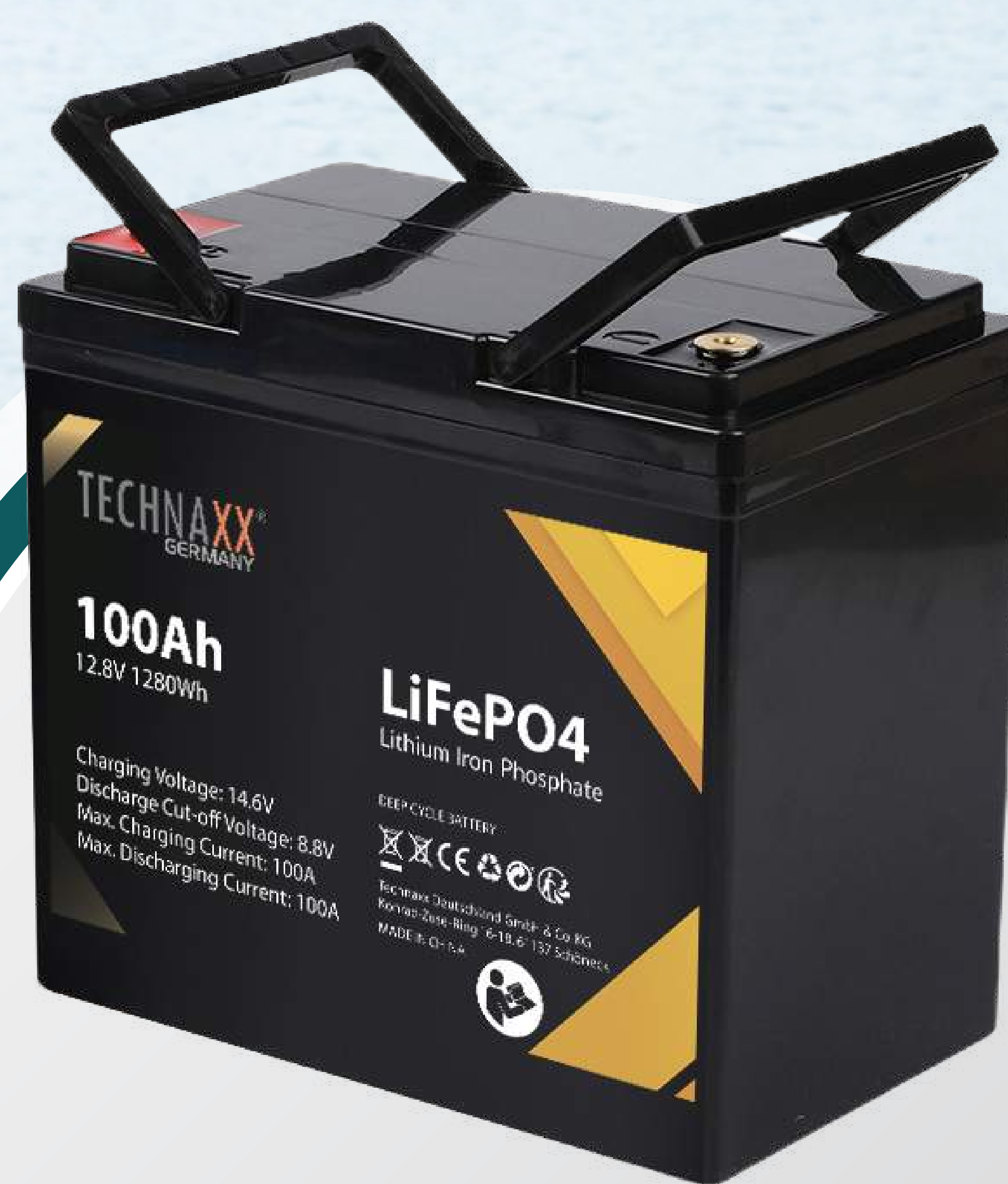
Solar-Batterie LiFePO4 TX-235