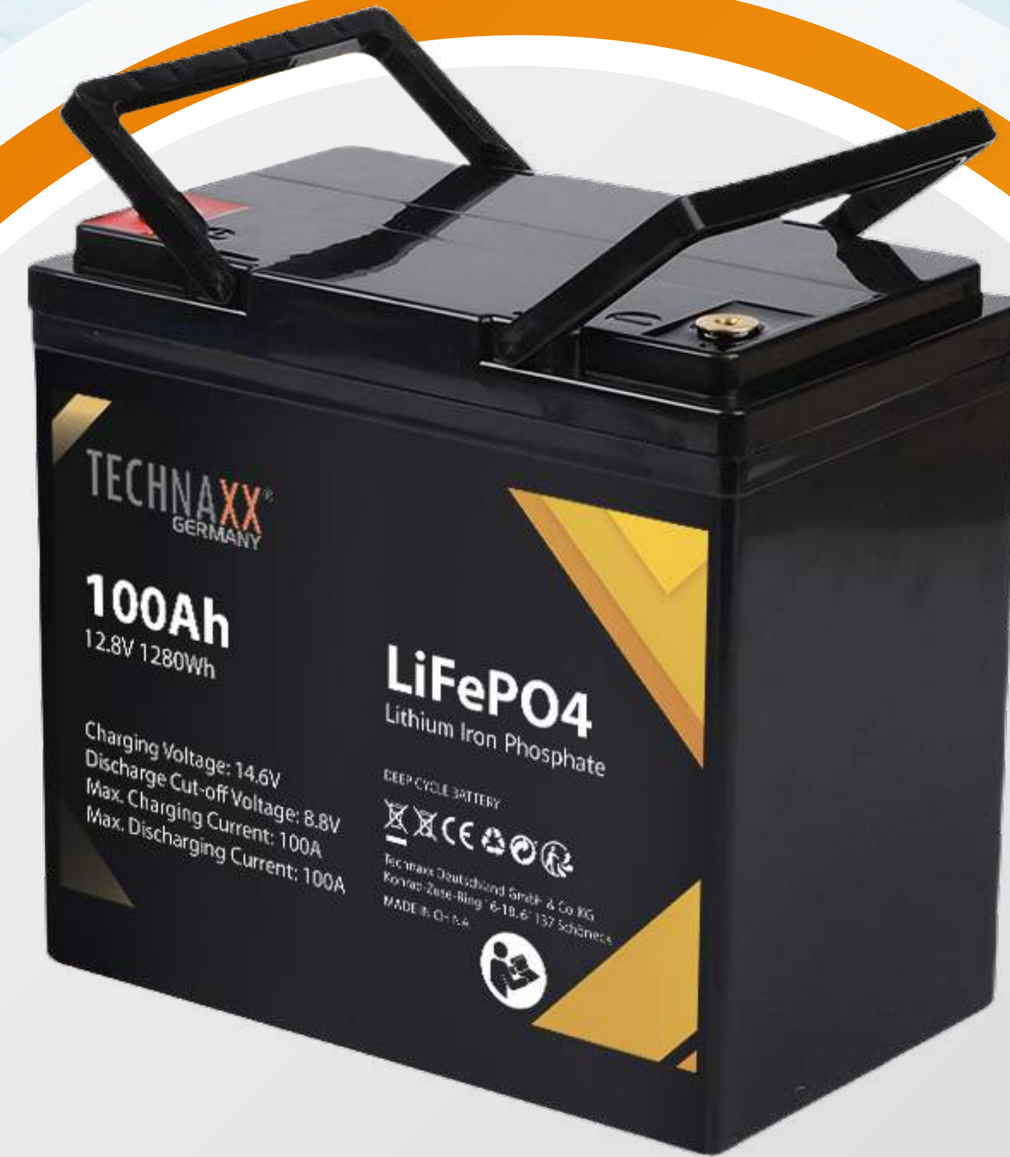
Solar-Batterie LiFePO4 TX-235