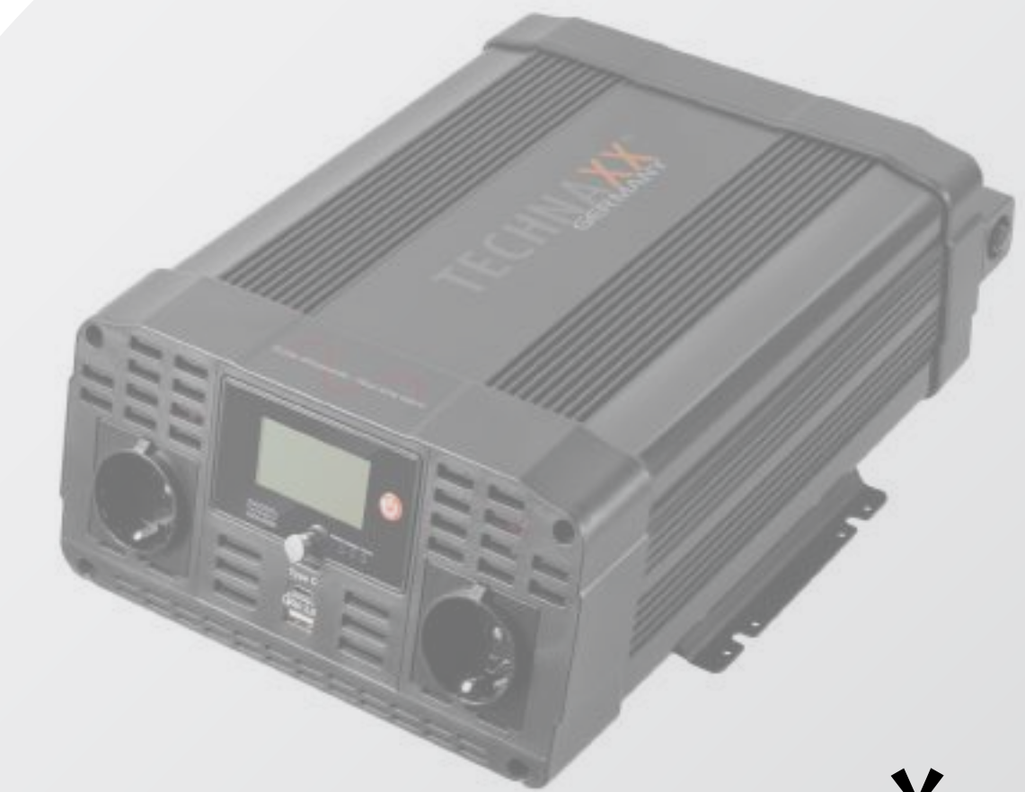
Power Inverters * TE16 TE19 TE20 TE22