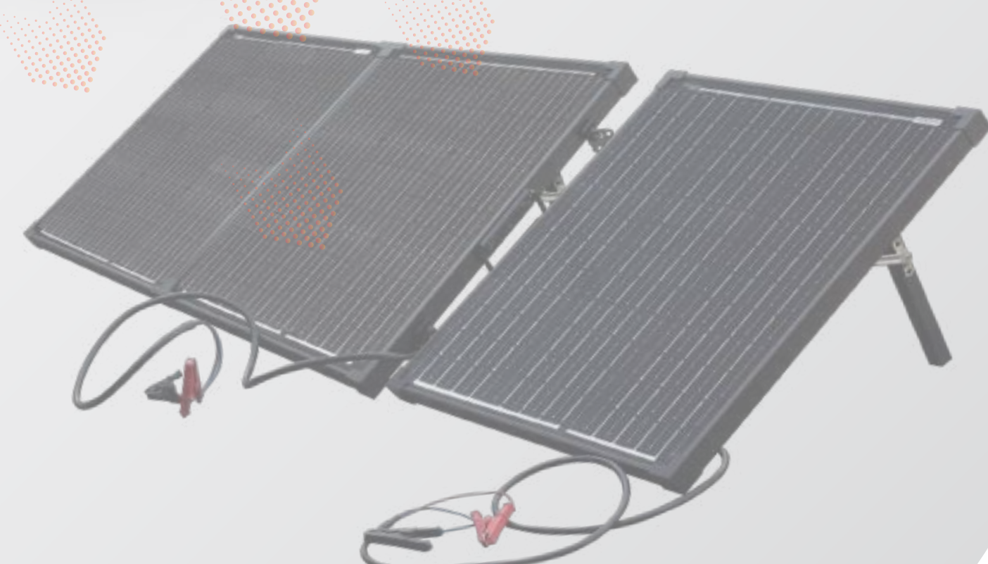
Solar panel * TX-215 / TX-214